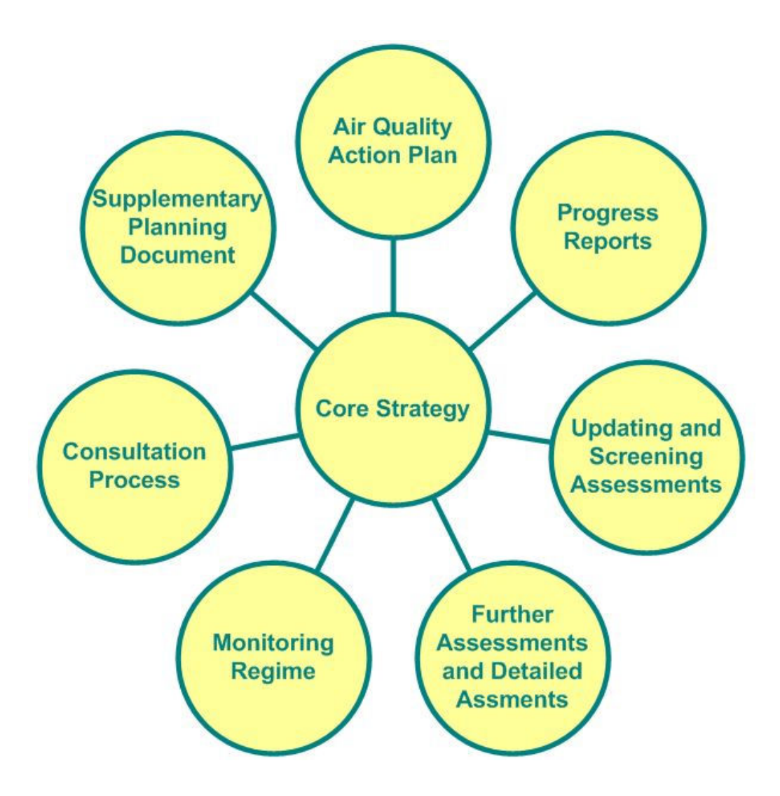
Figure 1: Structure of the Wiltshire Air Quality Strategy showing context of the Core Air Quality Strategy